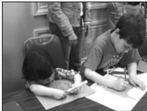
Creating placemats for Chai House