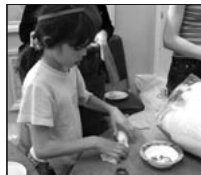
Making Catnip Toys