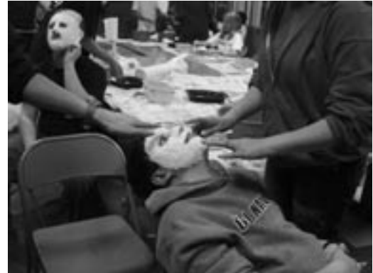
TJS Purim Masks