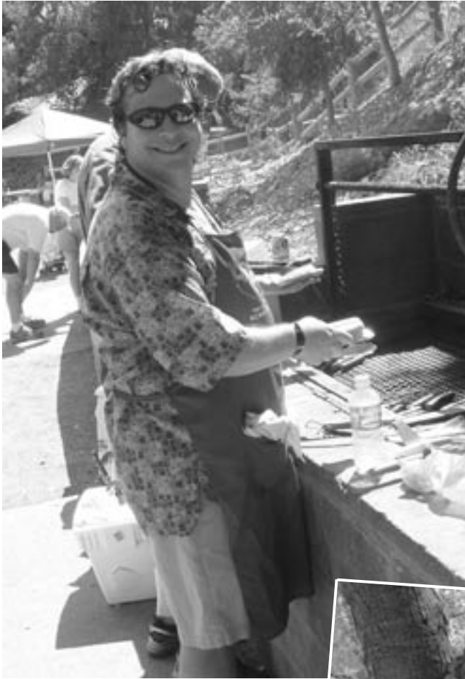
Memories from the Back to Preschool Picnic at Oak Meadow Park.

September was an exciting month in the preschool as we welcomed new students and welcomed back many old friends from their summer vacations. The month began with a huge back to school picnic at Oak Meadow Park. The kids enjoyed the playing with their friends, face painting, throwing balls and more. Families spent their time getting to know each other and we all enjoyed the delicious food and the amazing barbeque talents of Rabbi Magat.