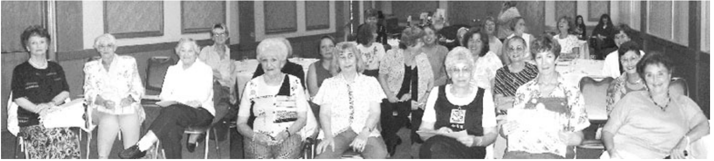
From The Pampered Chef