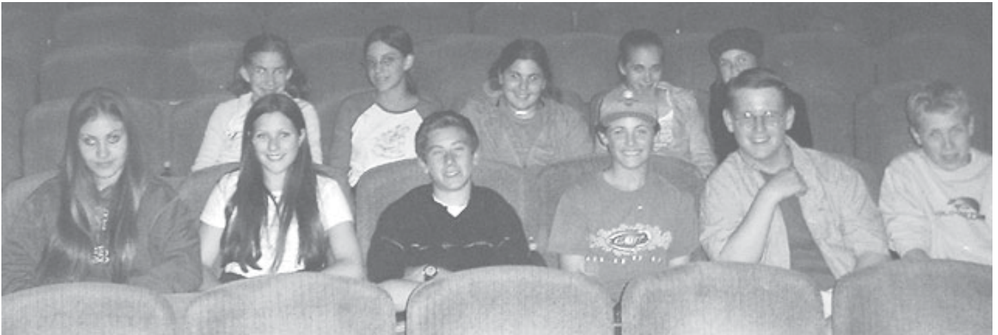
At Shabbat services, before Comedy Sportz